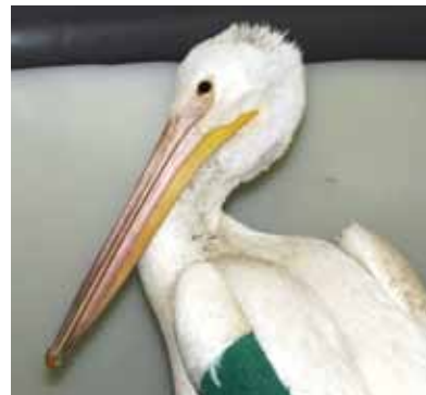
American White Pelican sports green wing wrap to stabilize injury.

We're grateful to the wildlife-loving donors who stepped up to fund the care and transportation costs for this beautiful wild animal. As of this writing, our first-ever pelican patient is still doing well.