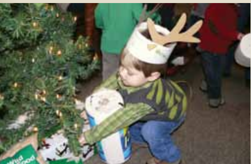
During the holiday season, "Frogs & Polliwogs" delivered "gifts for the animals" from our Wish List, an annual tradition for these parent and tot class participants.